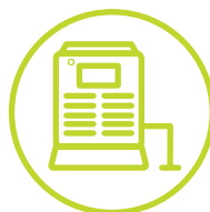
Stationary Standby Generator