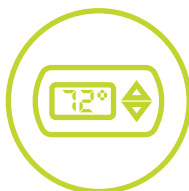
Heating & AC