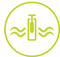
Pool Pumps & Solar Heaters